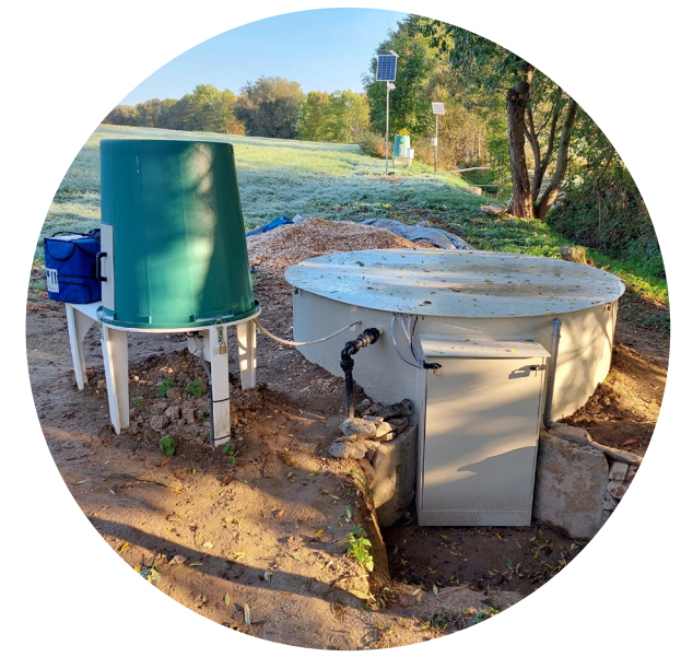
Figure 1: A real example of an installed semi-operational bioreactor unit.

To verify the usability of denitrifying woodchip bioreactors for the simultaneous removal of both nitrates and pesticides found in surface runoff from agriculturally active areas is the goal of research project "Comprehensive assessment of soil contamination with pesticides and in-situ remediation leading to eliminate their entry into groundwater". The project is being realised under the leadership of ALS Laboratories in cooperation with other research institutes. Work on the project will continue until 2025.